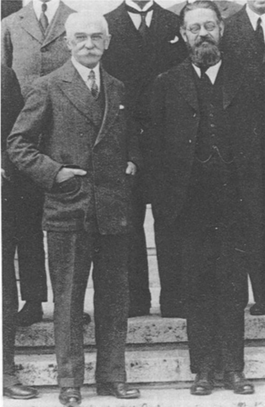
Pierre de Coubertin et Albert Thomas, lors de la réunion d'experts en matière d'éducation physique et de sports, en 1929 au B.I.T à Genève

Les progrès des sports irritent les partisans de la guerre des classes et intéressent sympathiquement ceux qui espèrent en des moyens plus doux pour amener les changements désirés par eux dans l'organisation de la société. La pratique des exercices physiques n'égalisent pas les conditions, mais elle égalise les relations et il est probable qu'ici la forme soit plus importante que le fond